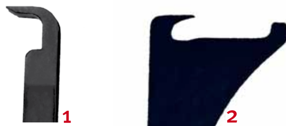
Partial view tool

Attach the holder to the vehicle with ring washers (Ø 20 mm diameter) using the existing drill holes.