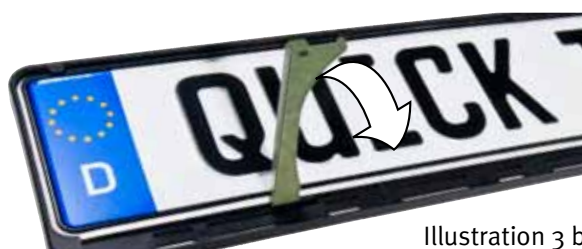
Illustration 3 b