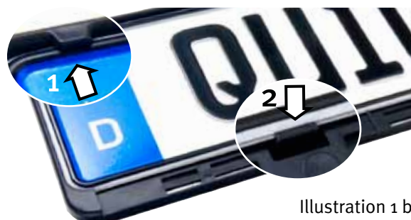
Illustration 1 b